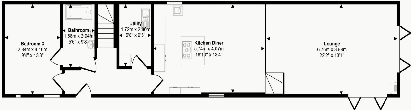
Ground Floor Approx 83 sq m / 896 sq ft

Approx Gross Internal Area 126 sq m / 1357 sq ft